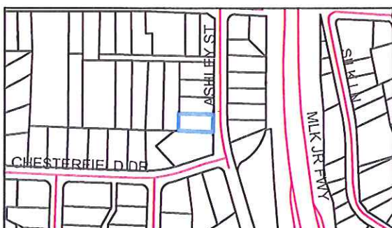
SITE MAP LT 18 E T SPENCE S/D TOLAR LD (0.19 AC)